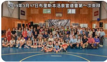
Brisbane Living Water Alliance Church (QLD)