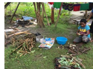
Papua - Bible College Students