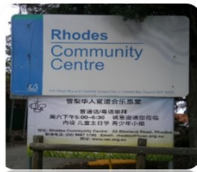
Rhodes Alliance Church (NSW)