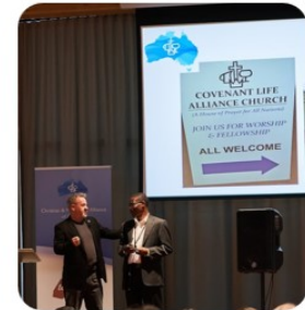
Covenant Life Alliance Church (ACT)