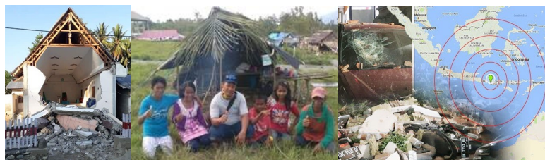
Disaster and Covid Relief Projects AWF