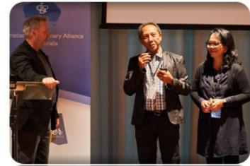
M1 International Alliance Church (QLD)