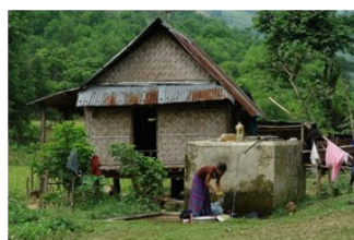
Vietnam - Bru Minority