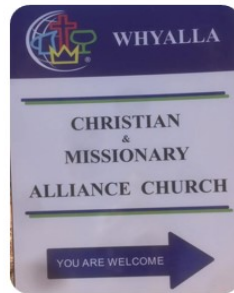
Whyalla Alliance Church (SA)