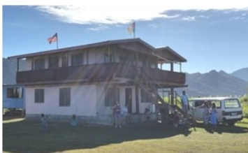
Fiji - Alliance Churches